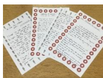
Year 6 – World War 1 poetry

Children across the school have been taking part in Remembrance Day activities to understand the sacrifice of others and the significance of our one-minute silence on 11 th November.