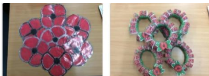
Mani Class made Remembrance Wreaths and Suncatcher Poppies. We also learnt the reason why we wear poppies on Remembrance Day.